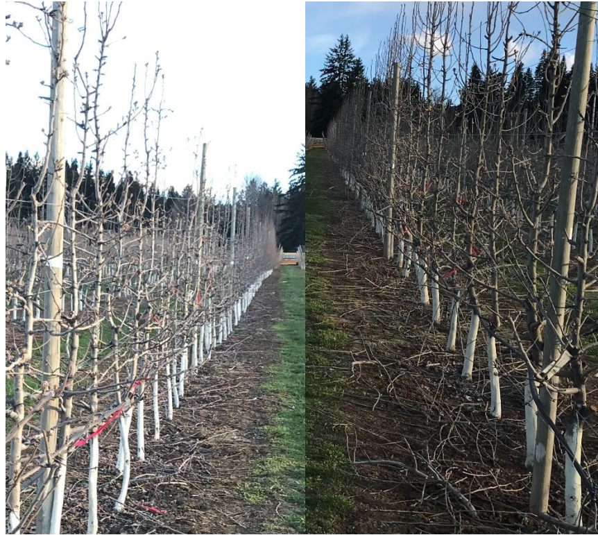
Photo 1. Bartlett (left) and Anjou trees (right) in OR after April 2022 pruning.